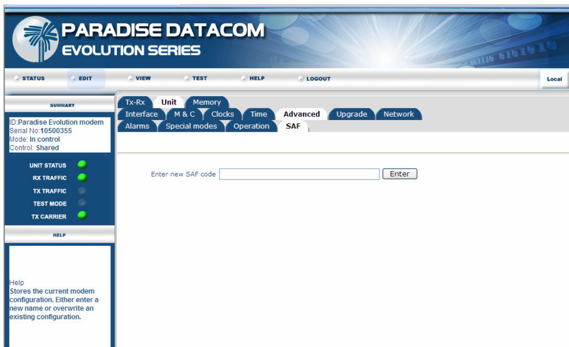
Entering a new SAF code