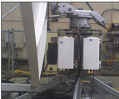
Antenna-mount 1:1 system w/ mounting frame

C-Band: 30W - 300W X-Band: 25W - 250W Ku-Band: 40W - 125W