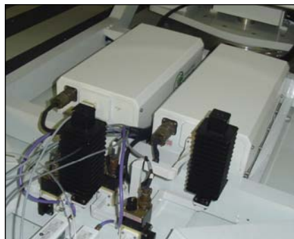
SNG-mount 1:1 system w/ side-mount AC input