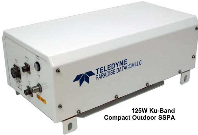
125W Ku-Band Compact Outdoor SSPA