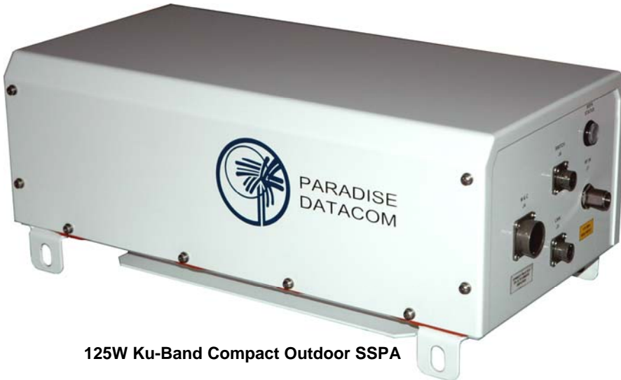
125W Ku-Band Compact Outdoor SSPA