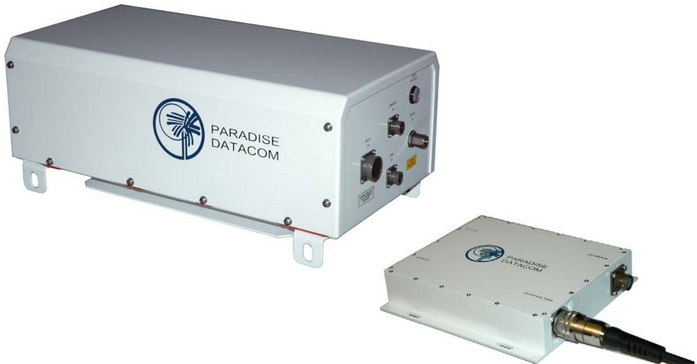
Compact Outdoor SSPA with External Fiber-Optic Interface (OFM-1000)