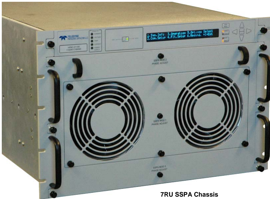
7RU SSPA Chassis