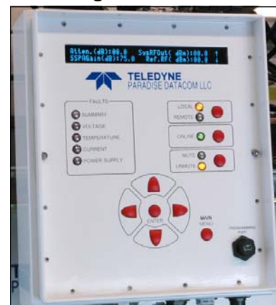
Figure 1: Master Controller

The Master Controller controls the mute state of the entire system. See Figure 1 .